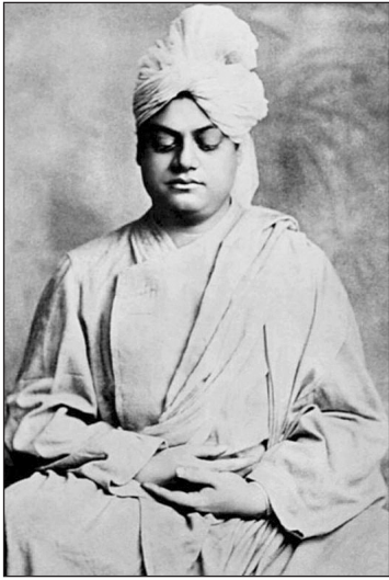
NATIONAL YOUTH DAY 12 JANUARY

Vivekanand's contribution for today's India can best be described as the 3C's- community, courage and Country. When a young individual is entrenched in dilemmas of life, he/she can lend a thought to the famous saint of India and learn to fight difficulties